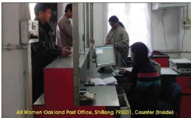
Fig 26: Oakland, Shillong (Meghalaya)

the visitors, visiting the cultural and commercial rural town setup in the Nilgiris region. The office reveres old cultural reverence in a rural locale of a south Indian setup (Fig 24 and Fig 25).