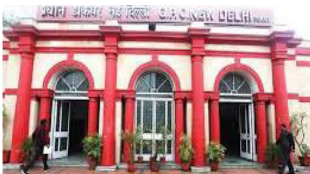
Fig 3: Gol Dak Khana, New Delhi HO.