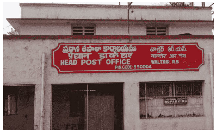
Fig 25: Waltair HPO, VIZAG, Vishakhapatnam (A.P.).

Agartala Post Office gives a promising mark to the visitors and explorers to the cityscape, enriching the urbane of northeast capital town. Waltair Head Office in a small agriculturist and Pisciculture dependent town near Vishakhapatnam port gives a nice view to