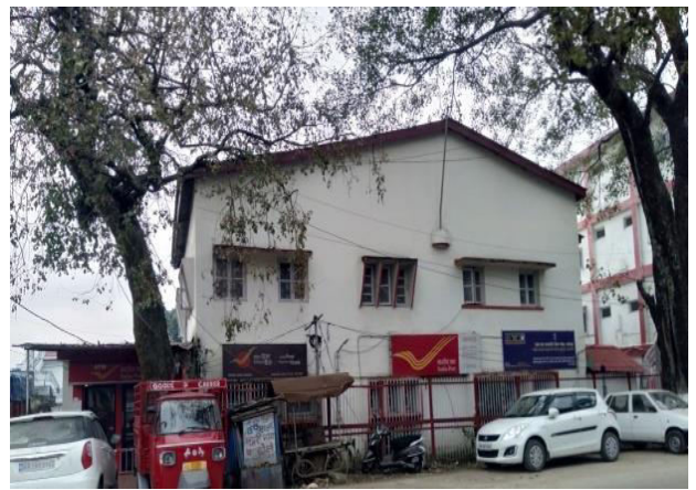
Fig 8: Kangra (H.P.)

The Head Post Office at Dharamsala has many stories to tell, being just settled on the entry point of the city, attracting many towards its vicinity adding to the blend of beauty of the premise. Kangra has much to say as an end stop of the Kangra valley narrow gauge railway line or having a stay place of infamous Brajeshwari Dham. The Head Post Office facilitate many tourist transact for their different needs in the journey. Additionally, India Post also facilitates for the parcel delivery at the doorstep for the tourist purchase made at the shopping outlets, especially for its MOU with HP Government ventures (Fig 7 and Fig 8).