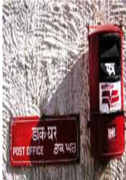
Fig 20: Ladakh HO.