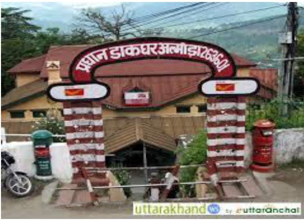
Fig 22: Almora (Uttarakhand).