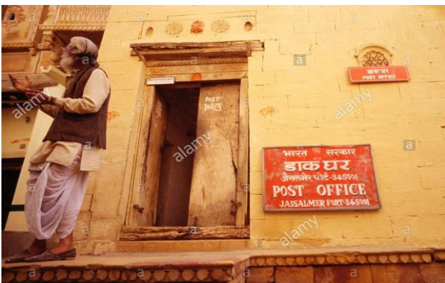
Fig 11: Jaisalmer (Rajasthan).

Jaisalmer, a border town, with high desert around the city. The city popular with the titles of Sun City or blue city, has many historic creatures attracting many travellers across the globe to come and stay for long. The post offices at the Jaisalmer Fort attract many comes the fort. The post office is specifically cultured in the tone of traditional Rajasthani Marwari town old house, truly giving a glaze of a living experience. Tourist comes here to especially post, purchase post cards, stamps and other philately at the post office. It adds on to the cultural heritage of the place in multifaceted ways ( Fig 11 and Fig 12 ). cultural reference of the city. Coloured pink at most,