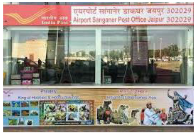
Fig 14: Sanganer Airport, Jaipur (Rajasthan).