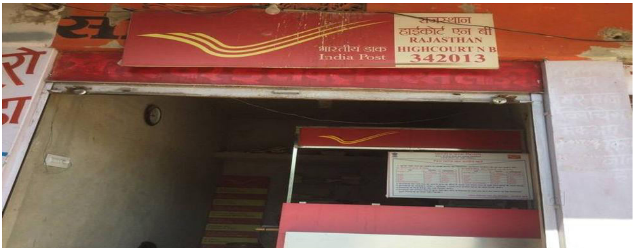
Fig 15: Jodhpur.

Jodhpur High Court in the historic town of Jodhpur have much cultural and tourism significance, as a popular public place. Attracting many to explore towards its ends. After the historical Lahore, Delhi, Mumbai and Chennai, this place has much to say about the Indian historical background of the subcontinent and speaks much about the modern city with its British era artefacts and architectures. The