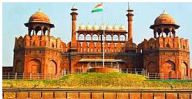
Fig 2: The Red Fort ('Lal Qilla').