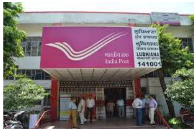
Fig 10: Ludhiana (Punjab).

Amritsar is religiously popular for infamous Golden Temple, Jallianwala Bagh, Indo-Pak Border Retreat Ceremony and many more. The Head Post Office at the Court Road, near rialto square is a popular place with many amenities for the tourist coming to the town. The historic building adds to the glory and historical significance of the place, with its indo-sarsenic artefact structures, adding to the tourism value and image of the city. In addition, the Golden Temple Post Office also adds on. Ludhiana, a transit station and hosiery industries hub, has its HO settled