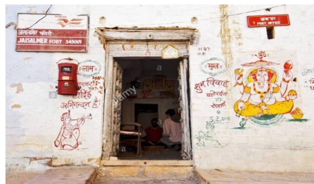
Fig 12: Jaisalmer Fort (Rajasthan).

Jaisalmer, a border town, with high desert around the city. The city popular with the titles of Sun City or blue city, has many historic creatures attracting many travellers across the globe to come and stay for long. The post offices at the Jaisalmer Fort attract many comes the fort. The post office is specifically cultured in the tone of traditional Rajasthani Marwari town old house, truly giving a glaze of a living experience. Tourist comes here to especially post, purchase post cards, stamps and other philately at the post office. It adds on to the cultural heritage of the place in multifaceted ways ( Fig 11 and Fig 12 ). cultural reference of the city. Coloured pink at most,