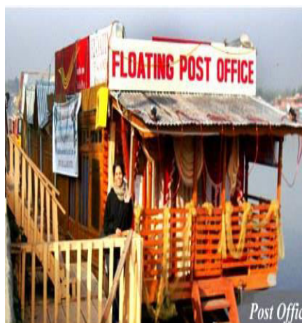
Fig 17: Dal Lake, Srinagar (J&K).