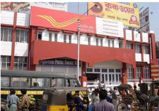
Fig 24: Agartala Post Office (Tripura).