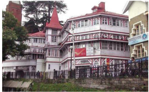
Fig 6: Shimla (H.P.)