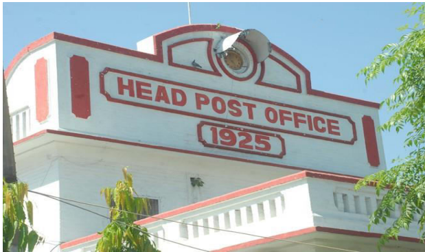
Fig 9: Amritsar (Punjab) .

Amritsar is religiously popular for infamous Golden Temple, Jallianwala Bagh, Indo-Pak Border Retreat Ceremony and many more. The Head Post Office at the Court Road, near rialto square is a popular place with many amenities for the tourist coming to the town. The historic building adds to the glory and historical significance of the place, with its indo-sarsenic artefact structures, adding to the tourism value and image of the city. In addition, the Golden Temple Post Office also adds on. Ludhiana, a transit station and hosiery industries hub, has its HO settled