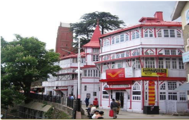
Fig 5: Shimla (H.P.)