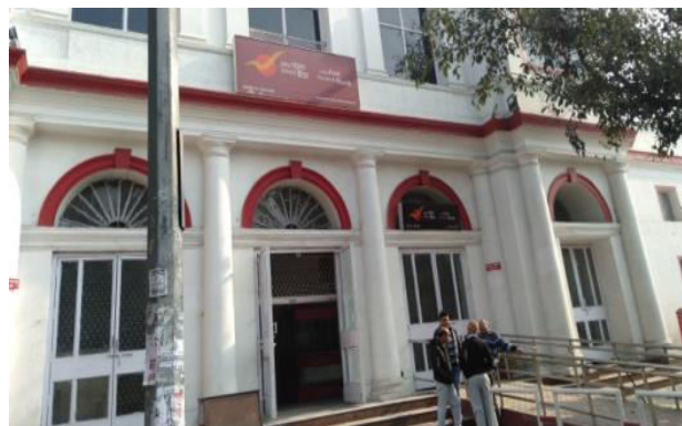
Fig 4: Old Delhi Kashmere Gate HO.

Settled just opposite the holy Gurdwara Bangla Sahib, in the globally infamous Connaught Circus, Gol Dak Khana has much reverence and contribution to the development and modernisation, facilitating the communication ( Fig 3 ). Same way, the Old Delhi Kashmiri Gate Head Post Office in facilitating the vicinity growth and strengthening the culturally and historically cultivated locality, having imprints of various dynasties ( Fig 4 ).