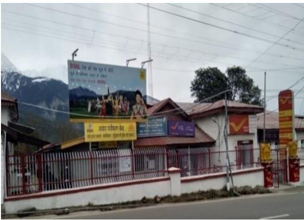
Fig 7: Dharamsala (H.P.)