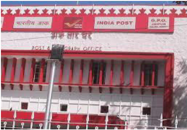
Fig 13: Jaipur (Rajasthan).