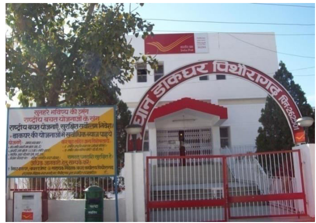
Fig 23: Pithoragarh (Uttarakhand).