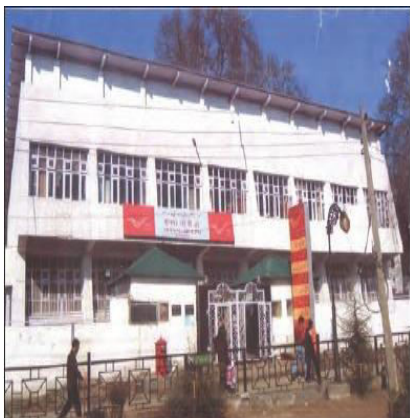
Fig 16: Srinagar (J&K) GPO.