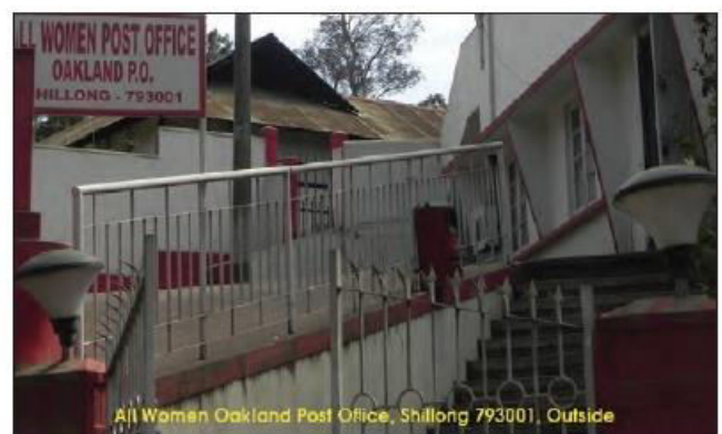
Fig 27: All Women Post Office.

All Women Post Office at Oakland, Shillong (Meghalaya) settled in north-east is giving a new message and is bringing up a feminine revolution, along with all India women bank. The place unanimously attracts explorers and visitors to come up to explore the place as a new and unique initiative towards women UniversePG | www.universepg.com