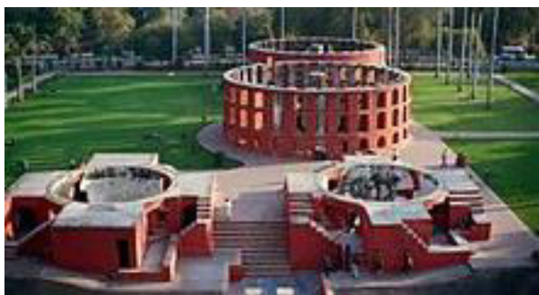
Fig 1: Jantar Mantar, New Delhi.