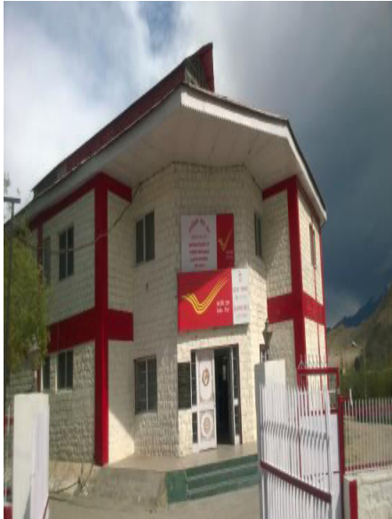
Fig 19: Leh HO (Capital).