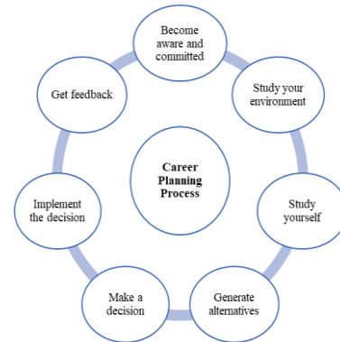
Fig 1: Career Planning Process.

planning is the progression of designing and implementing a career. As all individuals have different personalities and preferences, it is tough to establish an exact step-by-step sequence for a career planning process. Lock, (2004) proposes the following career planning process evolving from various sources.